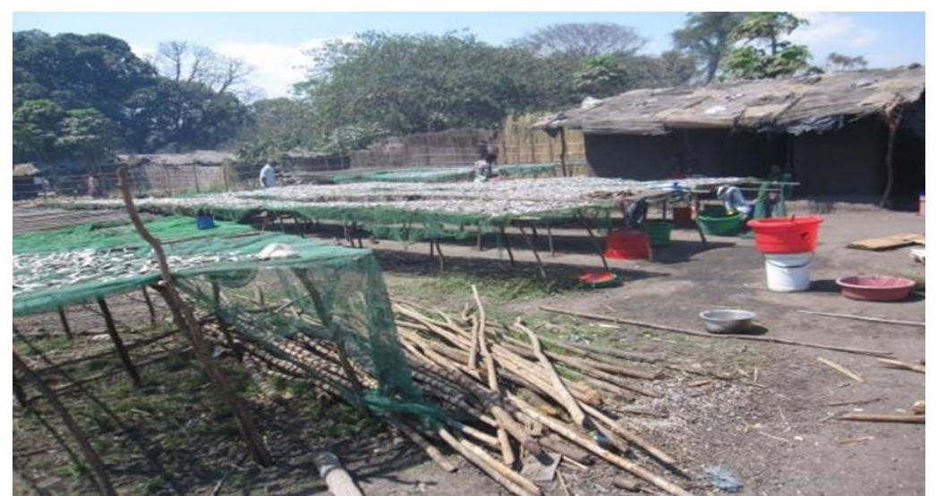
Figure 5: Migrant woman processing her fish on a drying rack where she sleeps, Kadewere fish landing site in Lake Malombe.

Focus group discussions with fishers in Malembo, Msaka, Lupetere, N'thubula, Kachulu, Chimwala and Chiphoole fish landing sites indicated that fishers in the four lakes tend to move to areas where fish is abundant throughout the year. Fishers usually come with their fishing equipment or units and hire local members as crew to fish. Migration can be seasonal depending on the nature of the fish being sought after. Often they sleep in rest houses or in temporary improvised houses made of reeds located in the beach fishing camps.