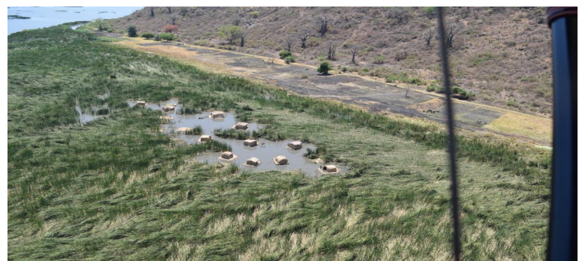
Figure 4: Accommodation structures (Zimbowera) built on the water in Lake Chilwa.

As such, fishers usually take young boys with them to help out with fish processing (gutting, sun drying and smoking) after which they sell the fish right at the camps to the buyers (usually men) who transport the processed fish to the mainland. Sometimes, a few women buyers send middlemen to buy for them from the fishing grounds.