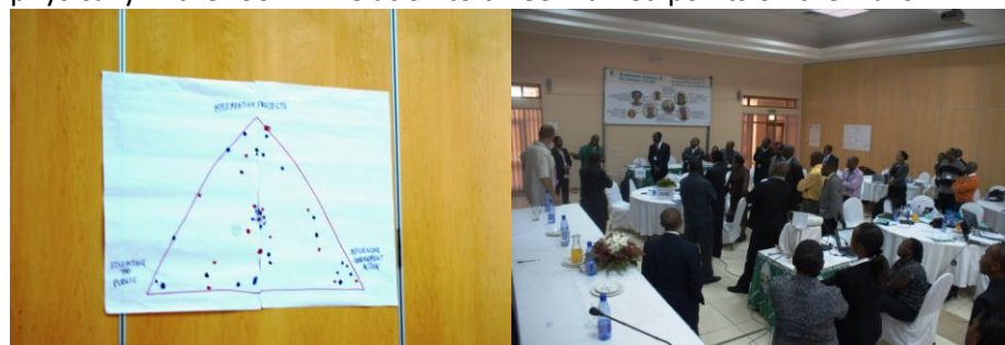
Triangle of experiences: Implementation, policy and awareness

The results were summarised in a triangular chart, as well as by participants placing themselves physically in the room in relation to three marked points on the walls.