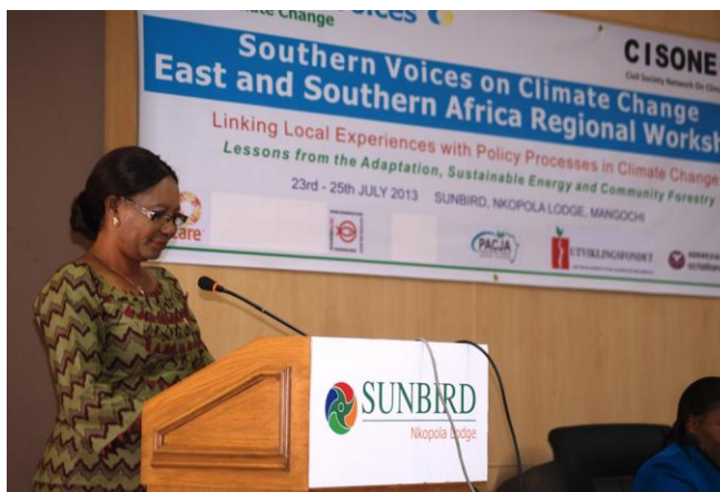
Hon. Halima Daudi, Minister of Env. & Climate Change Management opening the workshop

The workshop was honoured by the presence of the Minister of Environment and Climate Change Management, the Honourable Halima Daudi, MP. She spoke of the value of close cooperation between civil society and government in confronting the challenge of climate change, and invited the workshop to yield practical suggestions for national and regional action and policy.